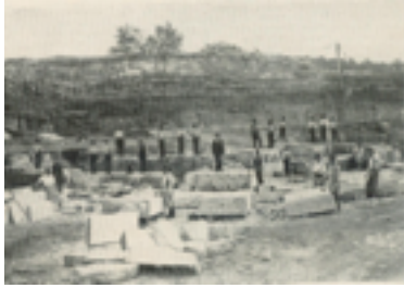
Men working at Whitmore's quarry Need link