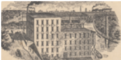
image of the Thompson Flour Mill showing the Erie Canal with the locks in the background, the old NY Central Railroad Bridge and horse-drawn conveyances on the road. Link