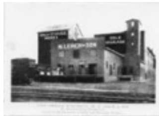
N. Lerch and Son Cold Storage, ca 1910 https://cdm16694.contentdm.oclc.org/digital/collection/p15004coll9/id/386/rec/1