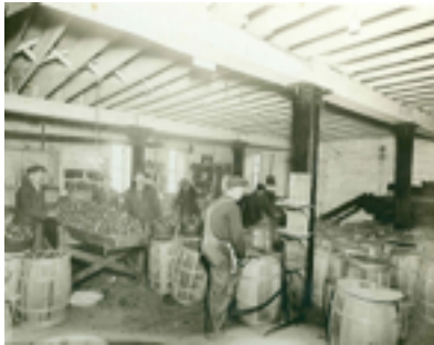
Getting apples ready for shipment on the Erie Canal, early 20thcent. Need link