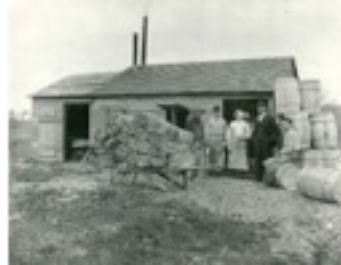
Photo from the NCHS collection showing a cart of staves ready to be turned into barrels. Link? And,